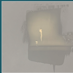
Scratch filled with RBL UV Putty