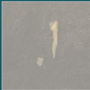
Scratch filled and feathered smooth