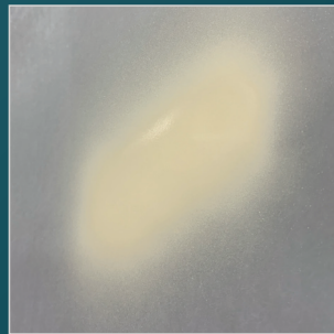
Prime over UV Putty