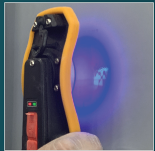
Putty cured in less than 30 seconds with RBL 10W Cordless Light