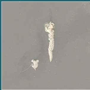
Scratch in body panel